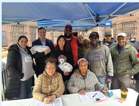
Distributing turkeys with community partners to NYCHA residents during Thanksgiving.