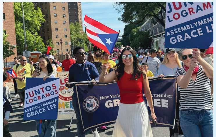
Marching in the 1st Annual LES Puerto Rican Parade and Festival.