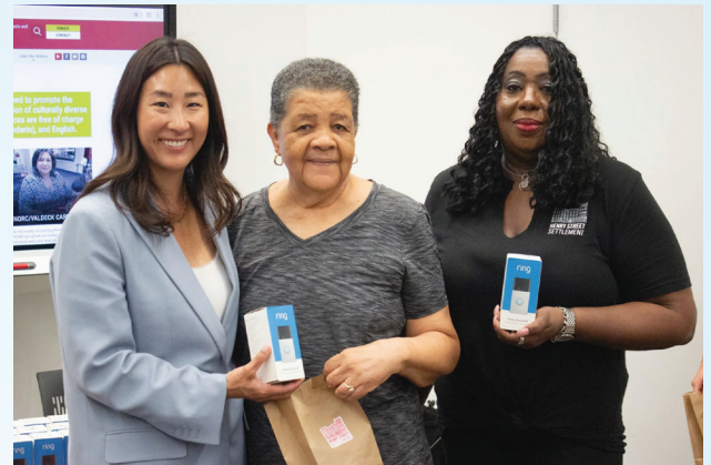
Providing peace of mind to seniors in NYCHA - distributing Ring cameras in partnership with Henry Street Settlement.

📦 We helped a constituent regain access to their private storage unit and save their belongings the day before they were auctioned off.