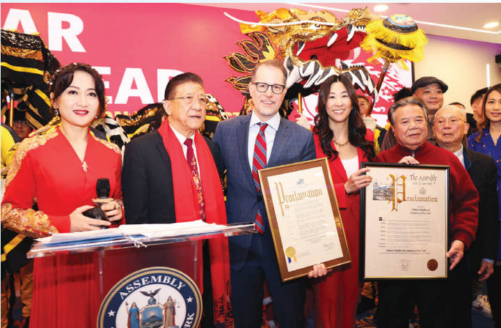
Welcoming the Year of the Dragon at the inaugural Lunar New Year Parade Celebration Breakfast.