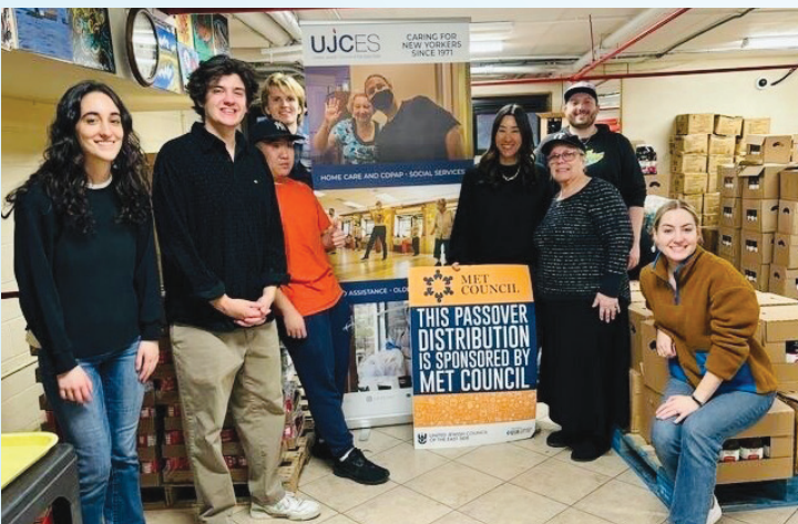
Participating in a day of service with the United Jewish Council of the East Side at their pantry.