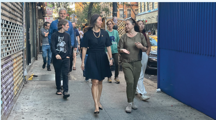
We led a walkthrough with residents concerned about safety and quality of life issues on the Lower East Side.