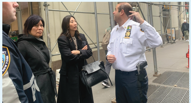
Our office organized a meeting with residents and NYPD's 1st Precinct to discuss conditions on Fulton Street.