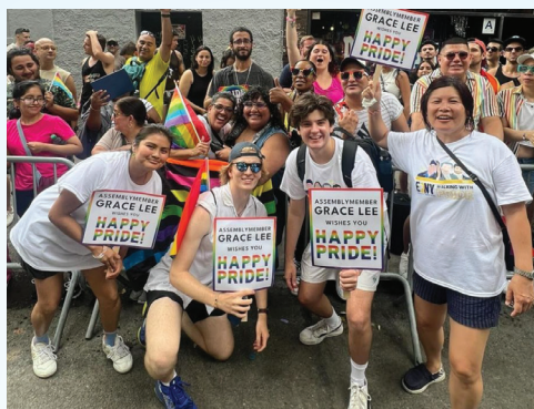
Celebrating LGBTQIA+ Pride at the 2024 NYC Pride March.