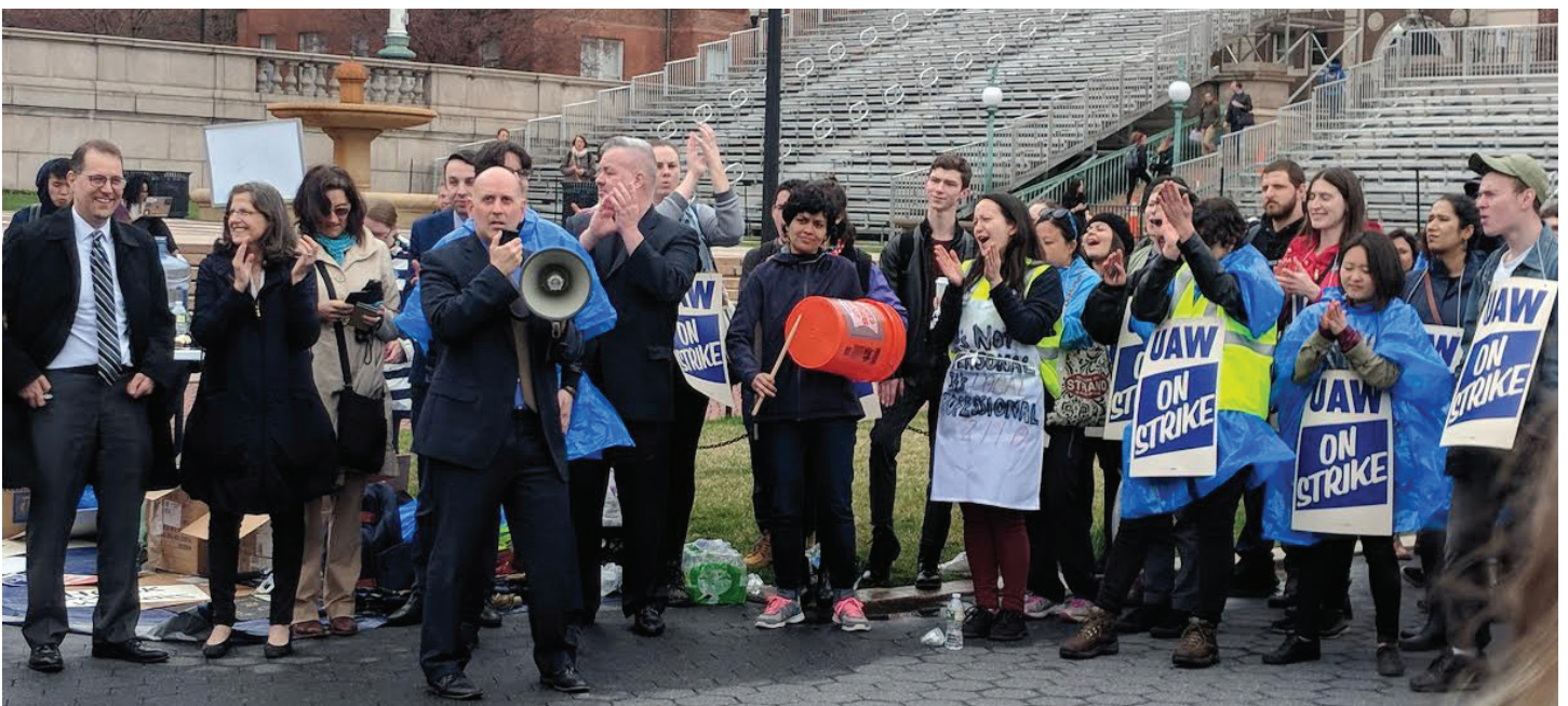
Just days after I was elected, I joined GWC-UAW to urge the administration at Columbia to recognize their union.

Survivors deserve every protection and support our State can afford them. This package represents a big step towards making New York a leader in providing the services survivors need to put their lives back together.