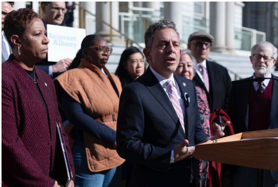
Speaking at the Charter Revision Bill Press Conference on the Steps of City Hall with Senator Liz Krueger, City Council Speaker Adams, Colleagues, and Advocates