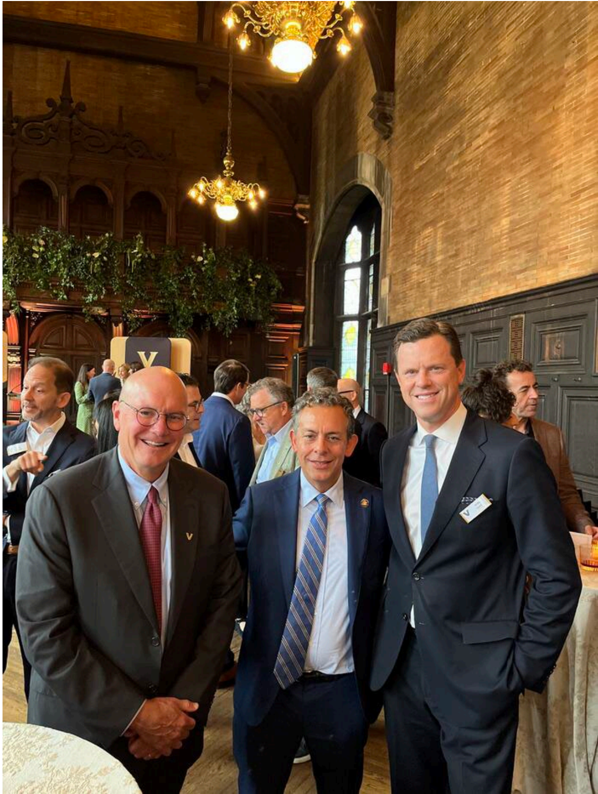
Meeting Vanderbilt Alumni, NBC's Willie Geist at the Vanderbilt University Announcement