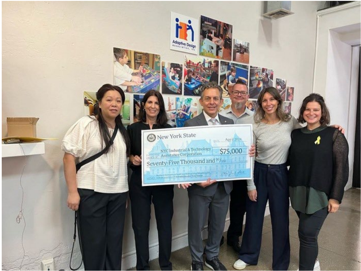
Presenting a $75K check for ITAC to support small manufacturers in the district