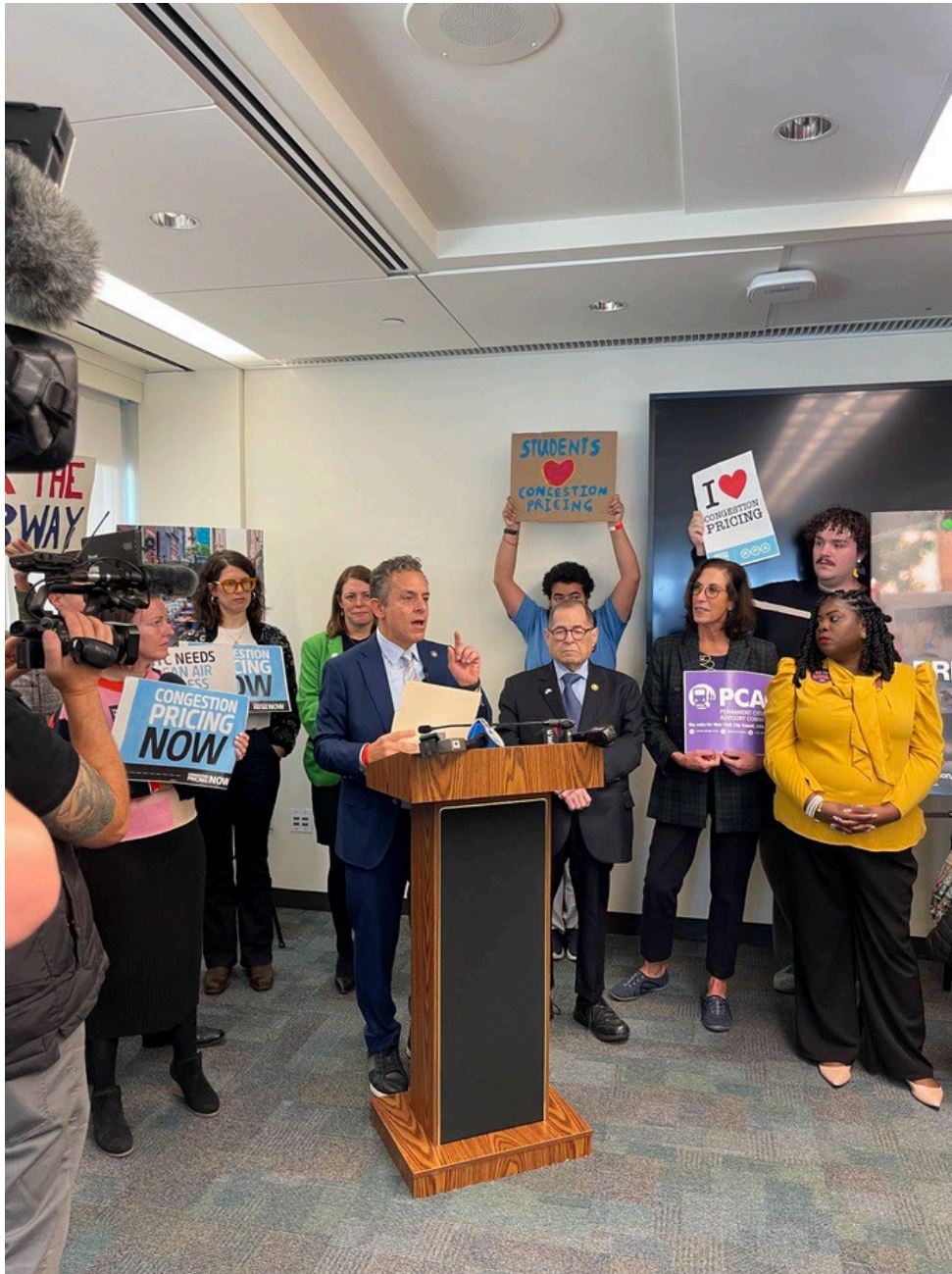
Speaking at the congestion pricing press conference at the MTA HQ

You can learn more about the Governor's new plan here .