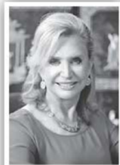
Congresswoman Carolyn Maloney

funded by Cancer Services Program of Manhattan and Judges & Lawyers Breast Cancer Alert