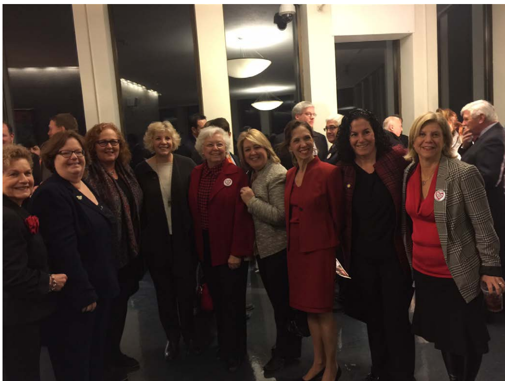
New York State Assembly Members in support of NYSUT's budget agenda

As a member of the Assembly Education Committee, I'm dedicated to fighting for increased funding for our public school system. This legislative session, my priorities are: