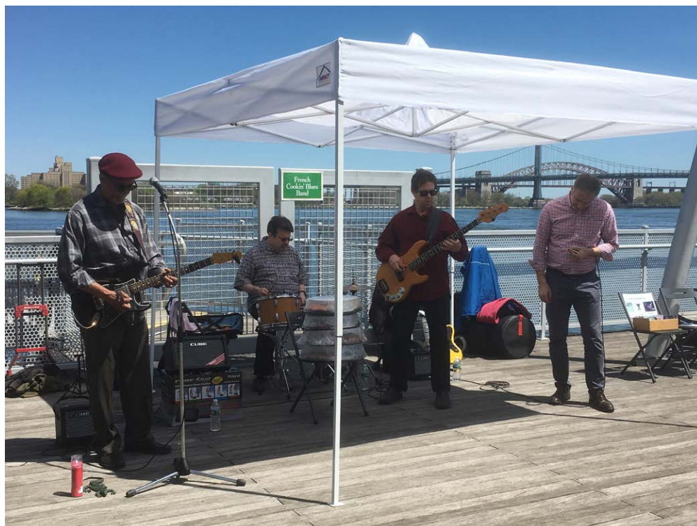
On Sunday, April 23, 2017 Esplanade Friends hosted "French Cookin' Blues Band" for a concert at