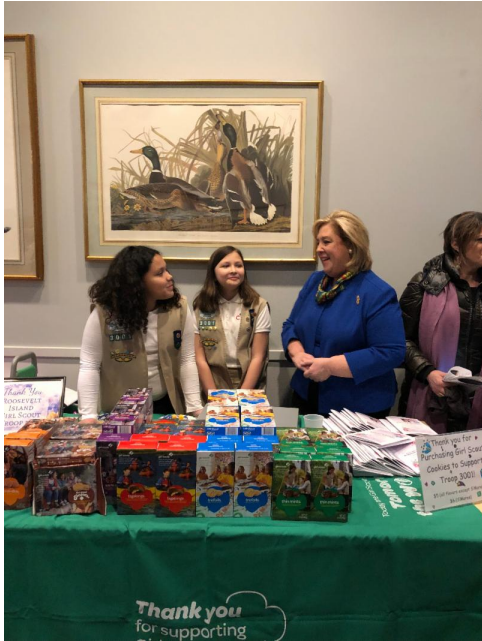
Roosevelt Island Girl Scout Troop 3001 took a break from selling cookies to speak to Rebecca about women and leadership.