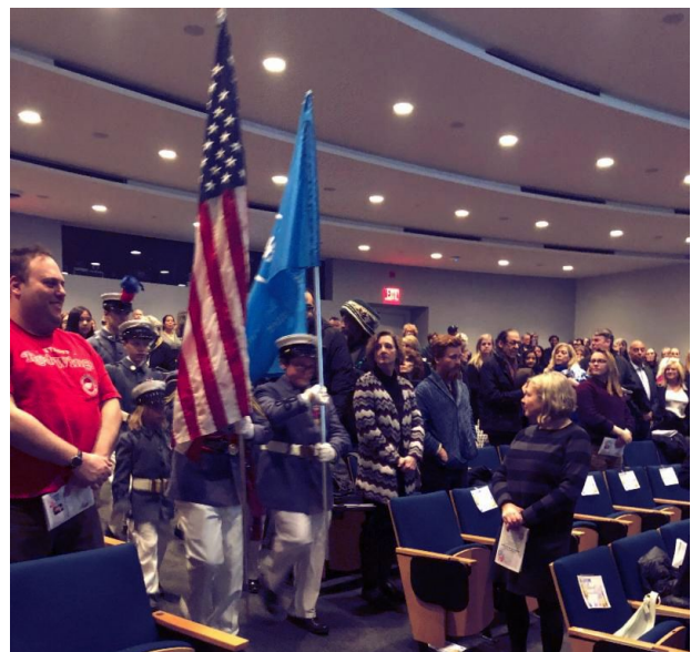
Knickerbocker Greys from the Park Avenue Armory joined the celebration!