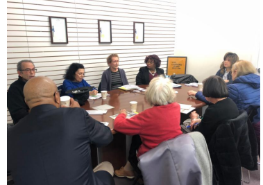
The Offices of the Taxpayer