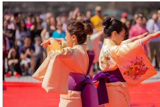
A traditional Japanese dance is performed at Four Freedoms Park for people attending the festival.