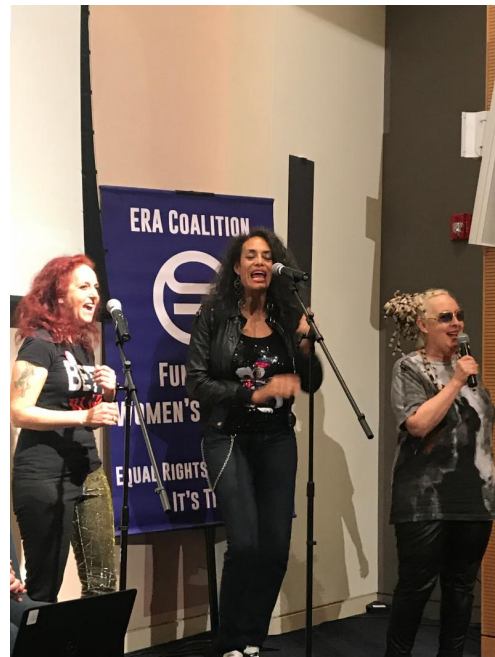
Musical and Activist group BETTY perform a musical selection for the attendees