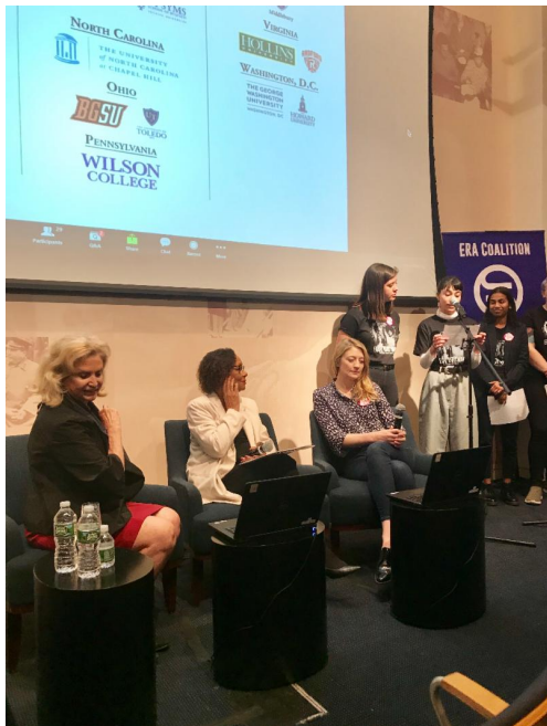
Panelists answer questions presented by the Grove Fellowship Students from Hunter College