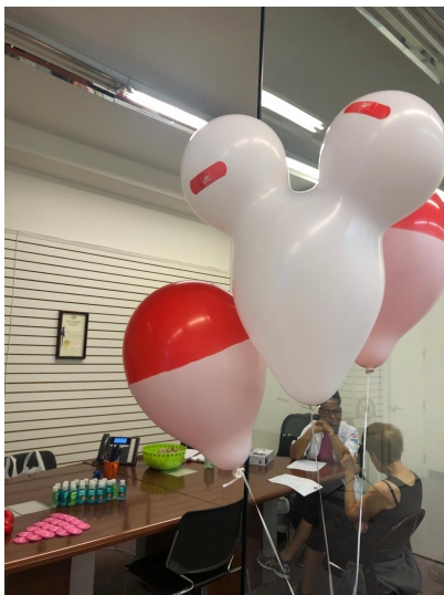
Walgreens also gave away hand sanitizer to help keep the community healthy.