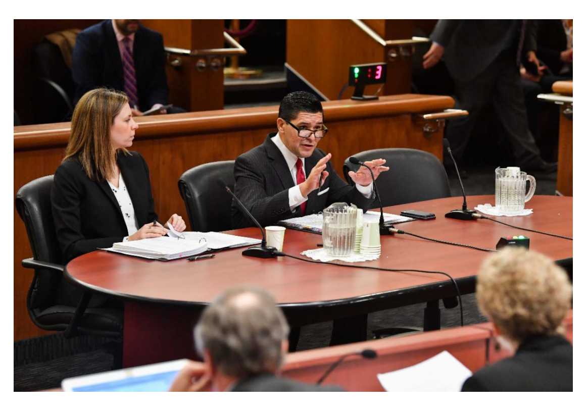
The Chancellor responded that there is a 5 year, $6 billion capital plan including an A/C for all initiative to get classrooms safely wired for air conditioning units, and to make old buildings modern and accessible. Carranza informed Seawright that his team will look into the idea of starting a city-wide mentoring program.

Additionally, Seawright asked: "Is there a plan to utilize graduates of the New York City School system as mentors for students?"