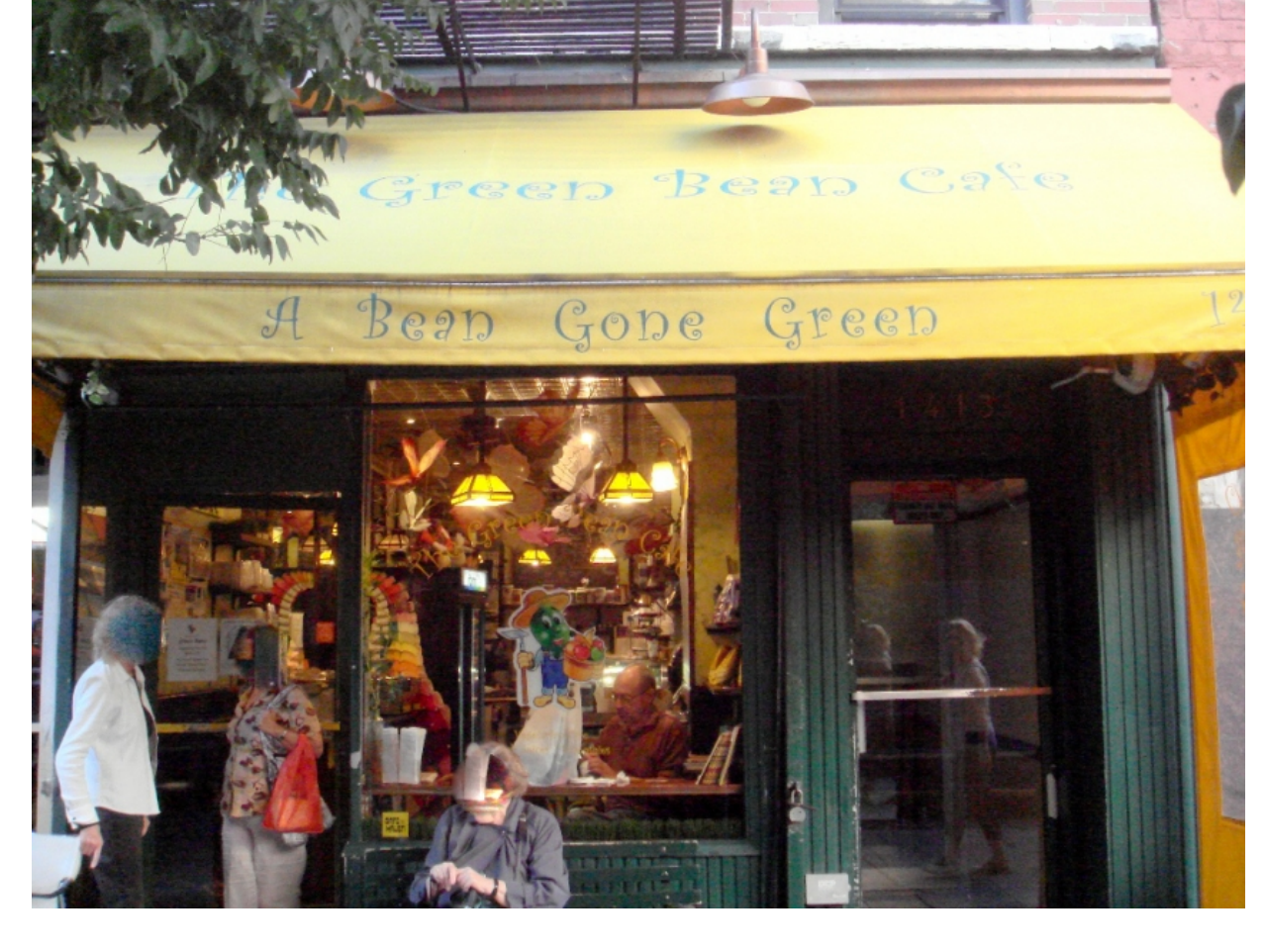
Located at 1413 York Avenue (at 75 Street), the Green Bean Cafe is a local vegetarian's favorite veggie cafe with an extensive juices and food menu. Offers main entrees, sandwiches, pizza, smoothies, desserts, all-day breakfast, vegan sweets, and some raw food.