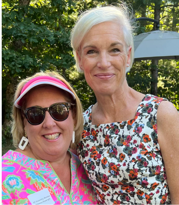
Planned Parenthood Federation of America President Cecile Richards discussing the overturning of Roe v. Wade.