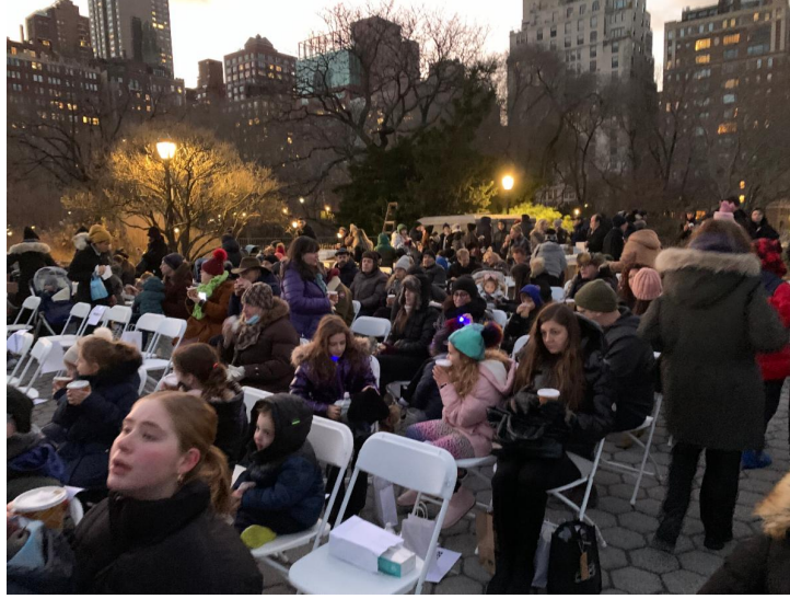
Hundreds gathered to witness the lighting of the first candle on the first night of Hannukah.