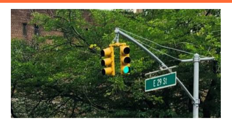
UES Community Board Split On E-Bikes

E-bikes have thoroughly infiltrated their way into New York City's transportation networks. They've become a recreational mainstay with the uptake of CitiBikes, all the while serving as a primary way of getting around for delivery service work alongside mopeds. Yet they have not been without their fair share of controversy.