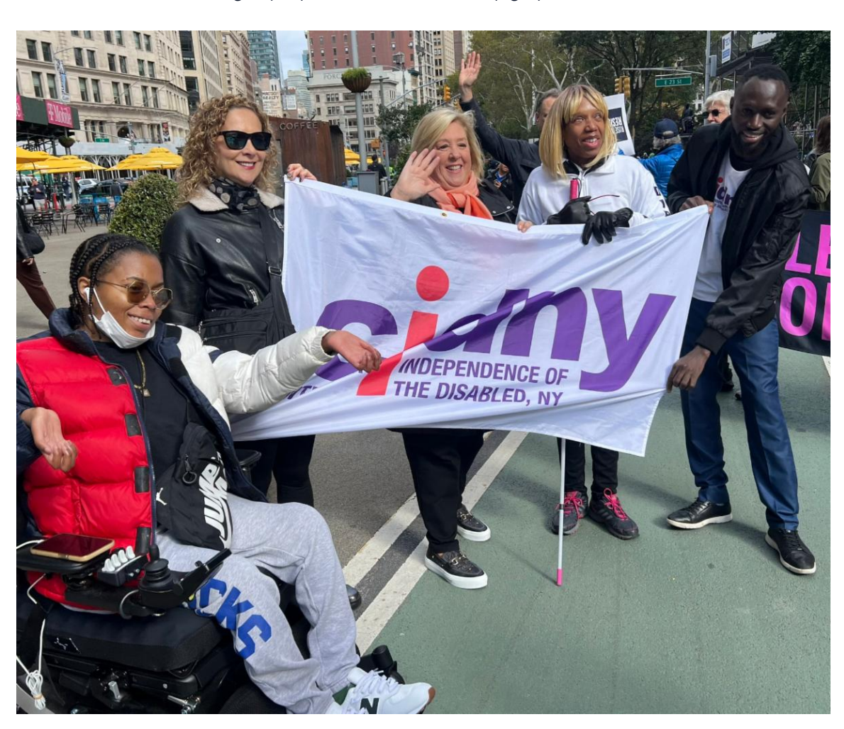
Center for the Independence of the Disabled New York advocates.

Assembly Member Seawright Delivers Remarks at Ribbon