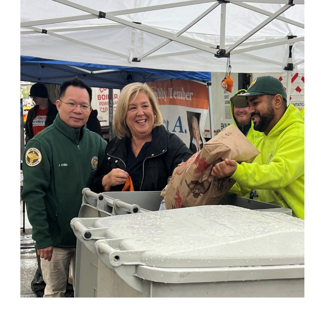
Carl Schurz Park Halloween Howl