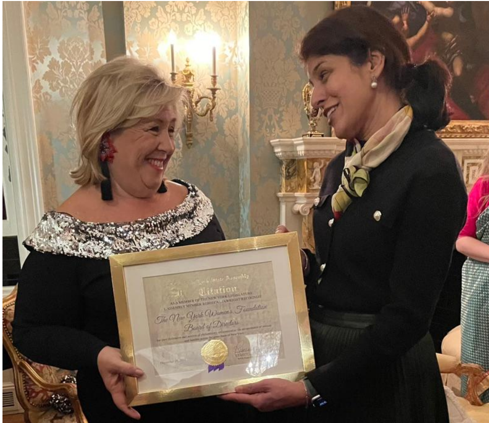
Assembly Member Seawright presented the New York Women's Foundation with an Assembly Citation for their work as the largest women-led grantmaking organizations in the world.