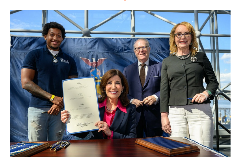
Law for Major Reduction in Gun Violence and Signs Legislation Strengthening New York's Nation-Leading Gun Laws

Alongside former U.S. Representative Gabby Giffords, Governor Hochul signed a package of bills cosponsored and strongly supported by Assembly Member Rebecca Seawright to strengthen New York's nation-leading gun laws by requiring gun sellers to post tobaccostyle safety warnings, taking action against dangerous "pistol convertors" and providing other new tools and resources to help protect more New Yorkers from gun violence. The package signed included the following bills: