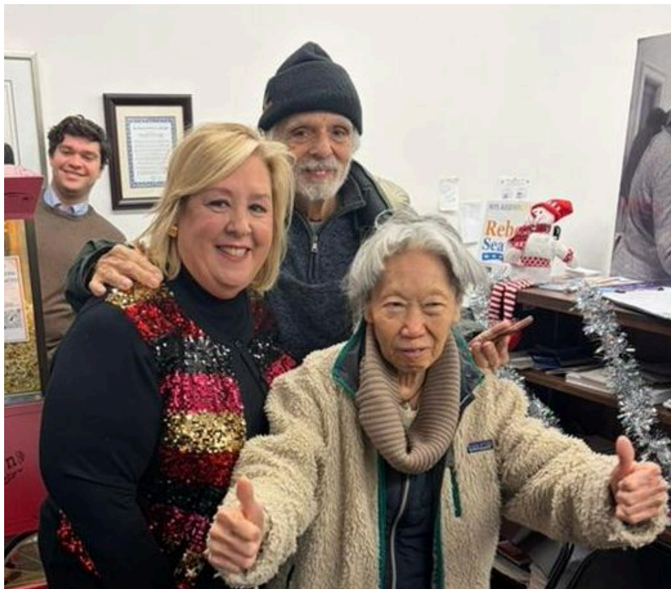
Seawright celebrated with our neighbors spreading holiday cheer.