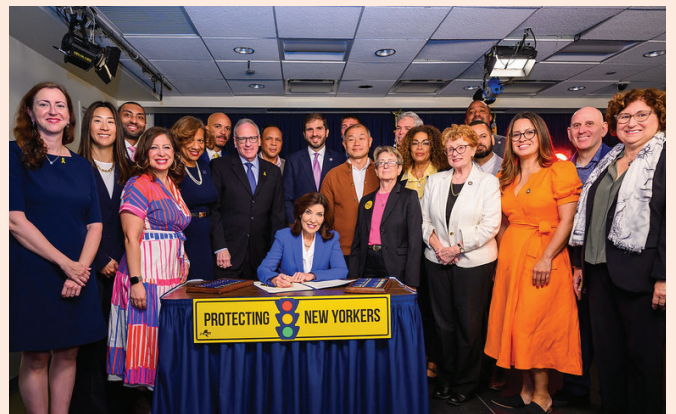
Assemblyman Jeffrey Dinowitz with many of his colleagues in government, including Senate bill sponsor Senator Andrew Gounardes, while Gov. Hochul signs his bill A.5259 to quadruple the number of intersections with red light cameras in NYC.