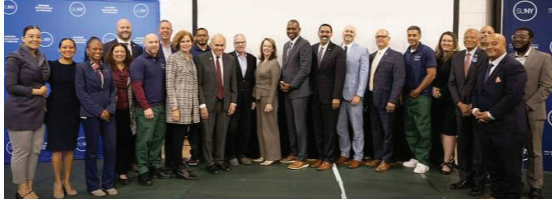
SUNY staff, legislators and attendees of the SUNY Higher Education in Prison Event.