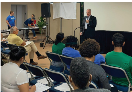
Assemblyman Jeffrey Dinowitz addresses the attendees of the Bronx Climate and Environmental Justice Town Hall.

I spoke at the Bronx Climate & Environmental Justice Town Hall at Bronx Bethany Church about my Climate Change Superfund Act (A.3351) and the need for Gov. Hochul to sign it into law. This legislation is vital for holding polluters accountable and protecting our environment.