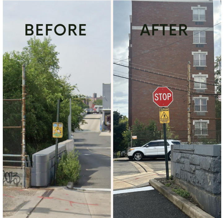
Before and After of the Stop Sign being replaced.

Our office successfully facilitated the replacement of a crucial stop sign that had been removed at the busy intersection of West 238th Street and Putnam Avenue, right by BJ's. This intersection saw significant pedestrian and vehicle traffic, and the missing stop sign posed a severe safety risk to the community. By working swiftly with city officials, we ensured the installation of a new stop sign, reinforcing our commitment to keeping our streets safe for drivers and pedestrians alike.