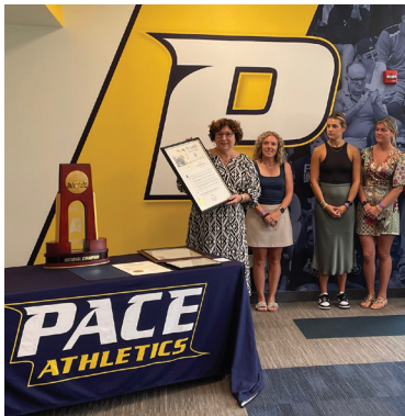
Celebrating the Pace University Women's Lacrosse Team, 2023 NCAA Division II champions — a Westchester County university's first national team title!