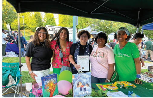
At National Day Out in Greenburgh with members of the Alpha Kappa Alpha Sorority