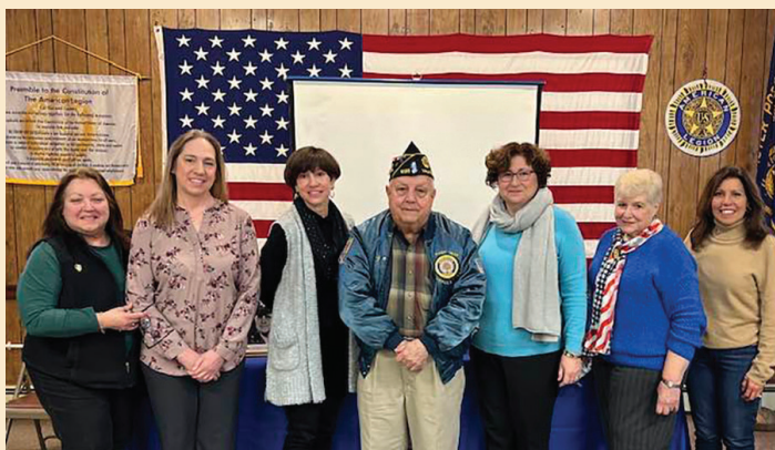
Commemorating the Four Chaplain Heroes of World War II at Valhalla American Legion Post 1038