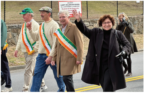
Marching in the Sleepy Hollow St. Patrick's Day Parade