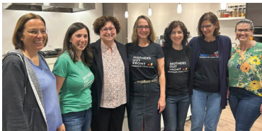
Learning about gas-free induction cooking at a Mothers Out Front event in the Zwilling Cooking Studio in Pleasantville