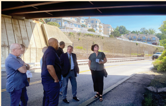
Viewing deterioration under the High Street Bridge in Dobbs Ferry