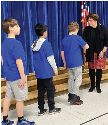
My ceremonial swearing-in at Springhurst Elementary School, Dobbs Ferry