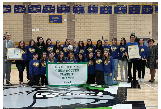
Celebrating the Irvington Girls Soccer team, New York State 2022 Class B champions