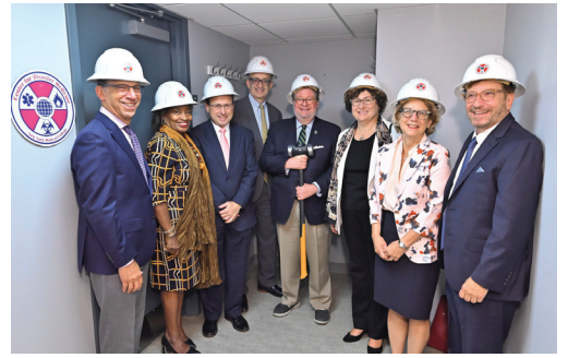
Touring the new disaster simulation and education facility at New York Medical College in Valhalla