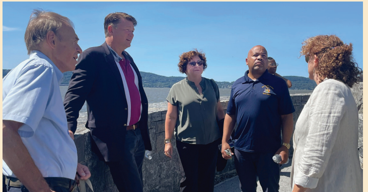
Inspecting the Tarrytown waterfront with Assembly Speaker Carl Heastie