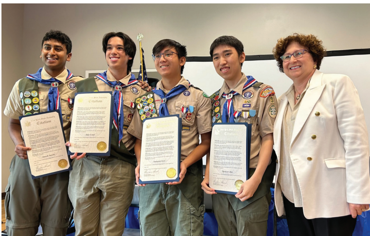
At the Court of Honor for Ardsley Troop 3's newest Eagle Scouts