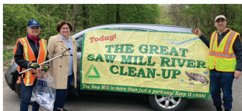
Keeping our environment healthy and beautiful at the Great Saw Mill River Clean-Up, Ardsley