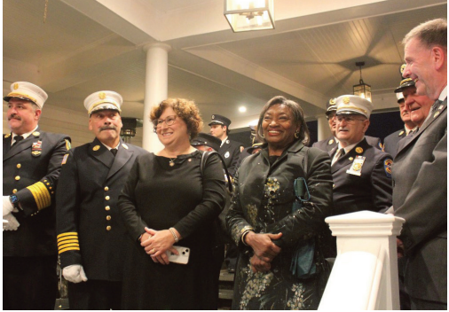
At the Elmsford Fire Department inspection