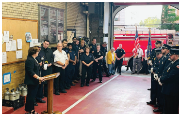
September 11th commemoration at the Dobbs Ferry Fire Department