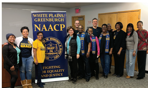
With the NAACP White Plains/Greenburgh chapter for their screening of Selma