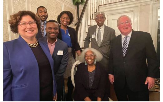
Celebrating Black History Month at Mercy University in Dobbs Ferry