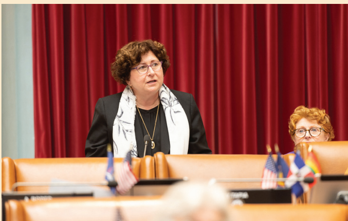
In session at the New York State Assembly Chambers in Albany

Sleepy Hollow was one of two Mid-Hudson Region villages to receive a $4.5 million grant from the NY Forward program. This award by New York State will support the revitalization