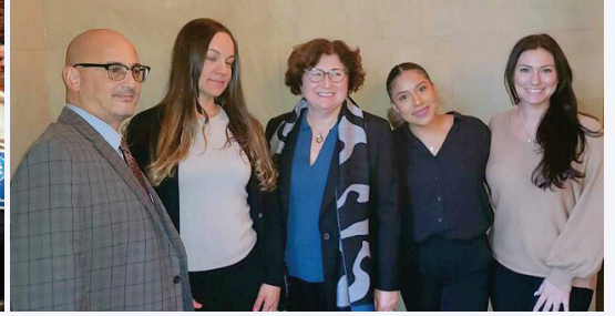
Meeting and rallying with our unions for New York's workers

To ease the burden on families, the enacted budget includes $1.78 billion for the New York State Child Care Block Grant (an increase of $754.4 million) and $350 million for the Supplemental Empire State Child Credit.