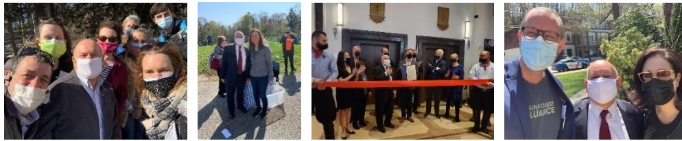
Attending (Left-Right): New Castle's 'Pay It Forward' event, the Bedford Hills Elementary School Pancake Breakfast, the restaurant opening of Fogo de Chão in White Plains, Mount Kisco's Earth Day celebration