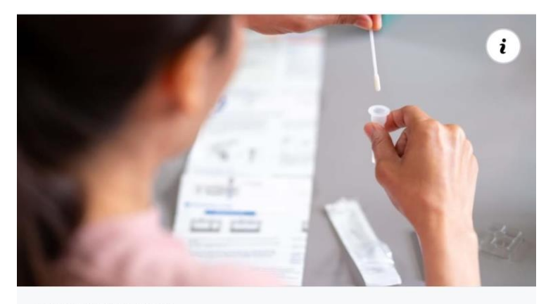
COVIDTESTS.GOV COVIDtests.gov - Free at-home COVID-19 tests

Additionally, insurance companies and group health plans must now cover the cost of eight over-the-counter at-home COVID-19 tests per person each month. Getting tested when necessary is crucial to protect yourself and others. Click here for more info.