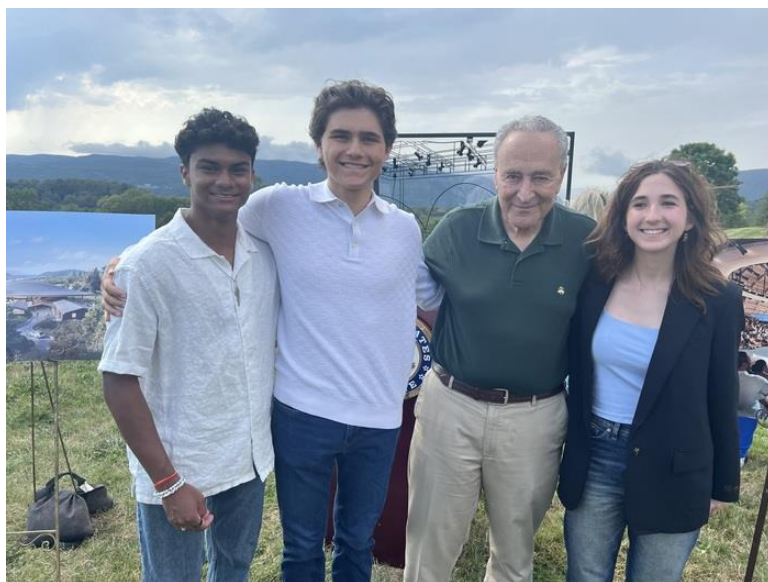
Interns from my office meeting U.S. Senate Majority Leader Chuck Schumer during an event this summer

Our summer interns have returned to college, and we are now accepting applications for school year internships on a rolling basis. Internships are very valuable learning opportunities, so please encourage the students in your life to apply! Click here to access the form to apply and/or share it.