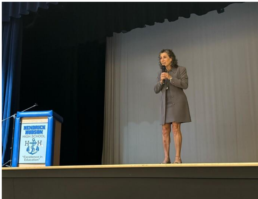
Greeting students on the first day of school

Happy first week of school! If school funding is on your mind, there is still a bit of time to submit written comments about the Foundation Aid formula as part of this year's Foundation Aid study. The public comment period for the study will close tomorrow, September 6; click here to visit the Foundation Aid Study web page and submit your comment using their form.