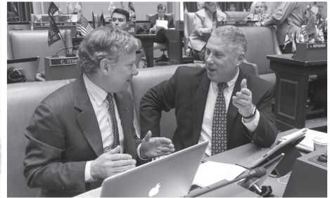
Working with Assemblymember Otis (91st Assembly District–Westchester County) in the chamber.

As both Steve and I know from our years as Mayors, the need to invest in clean drinking water and sewage treatment results in significant challenges for municipalities that are unable to fund the overall costs of these projects. This grant program is a good start to address an infrastructure system that is woefully in need of support and lacks proper resources.