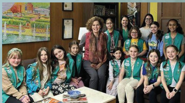
Meeting with Guilderland Girl Scout Troop 5027 in our office at the State Capitol: As the future leaders of New York, I was impressed by their knowledge of state government and can't wait to see what they do next!