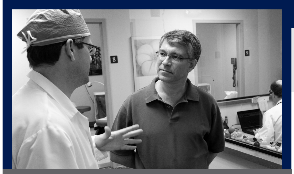
"Good health is invaluable. The right insurance plan can be an important step in protecting your family's health." - Assemblymember Phil Steck