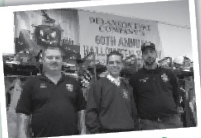
Greeting trick-on-treaters at the Delanson Fire Department's 60th Annual Halloween Party