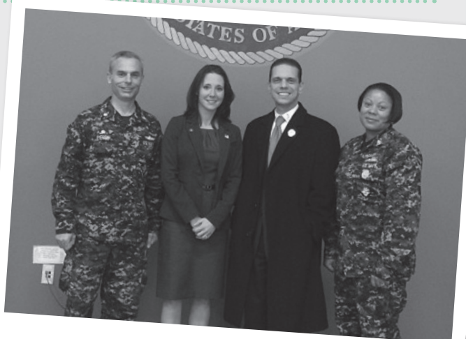
Touring the Naval Operations Support Center in Schenectady County.