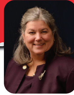
Assemblywoman Carrie Woerner