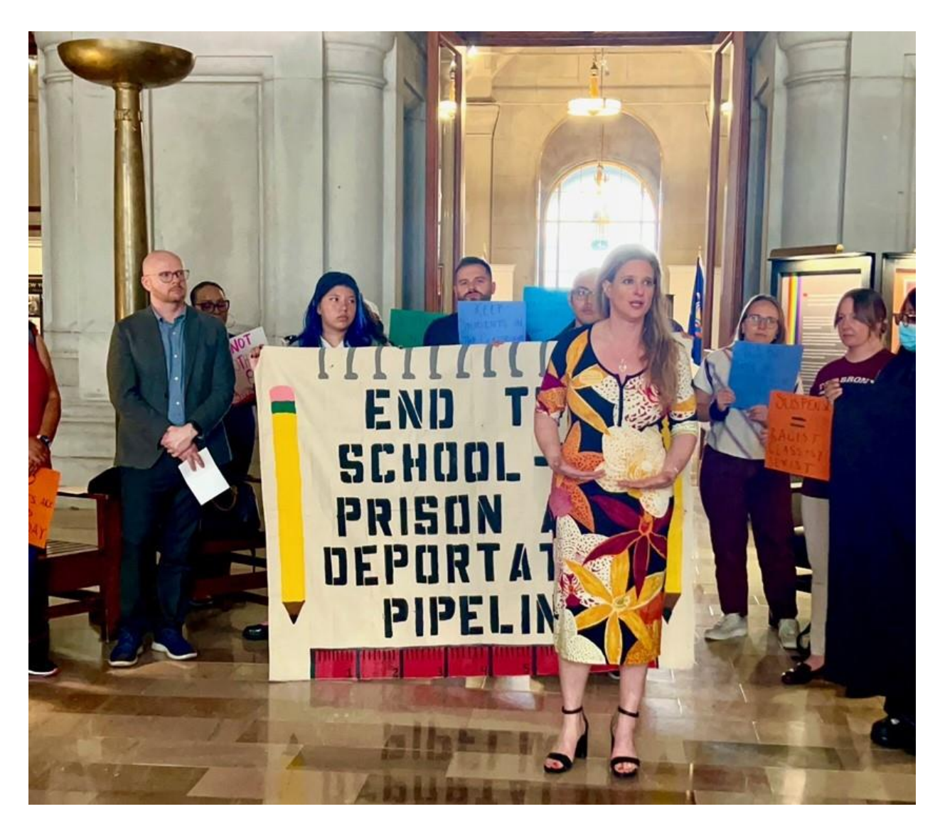
Solutions Not Suspensions (A5691, Solages)