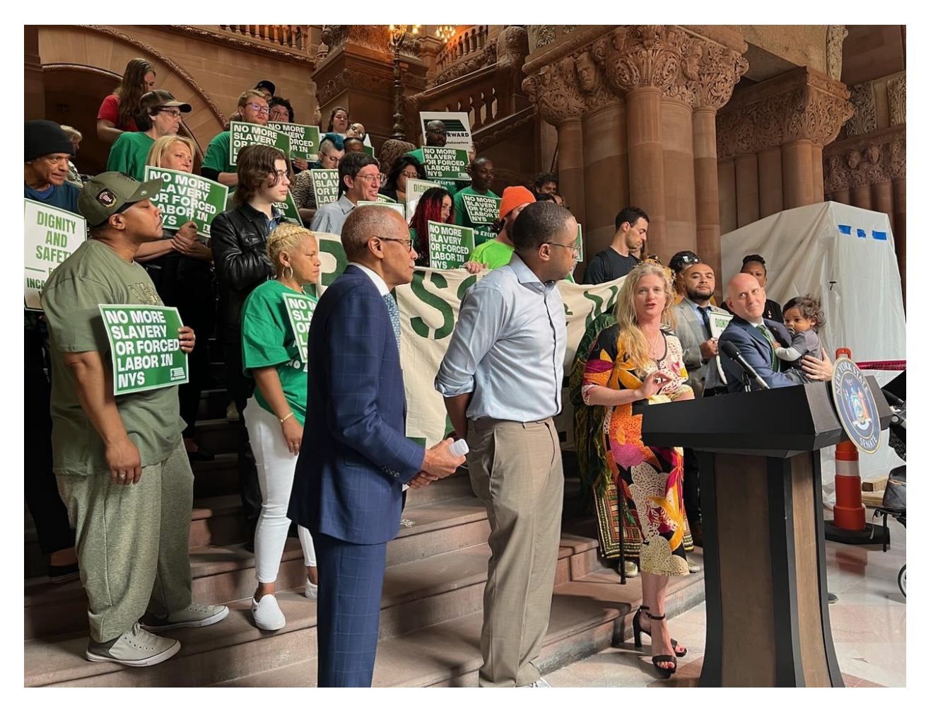
No Slavery NY (<u>A3412b</u>, Epstein)