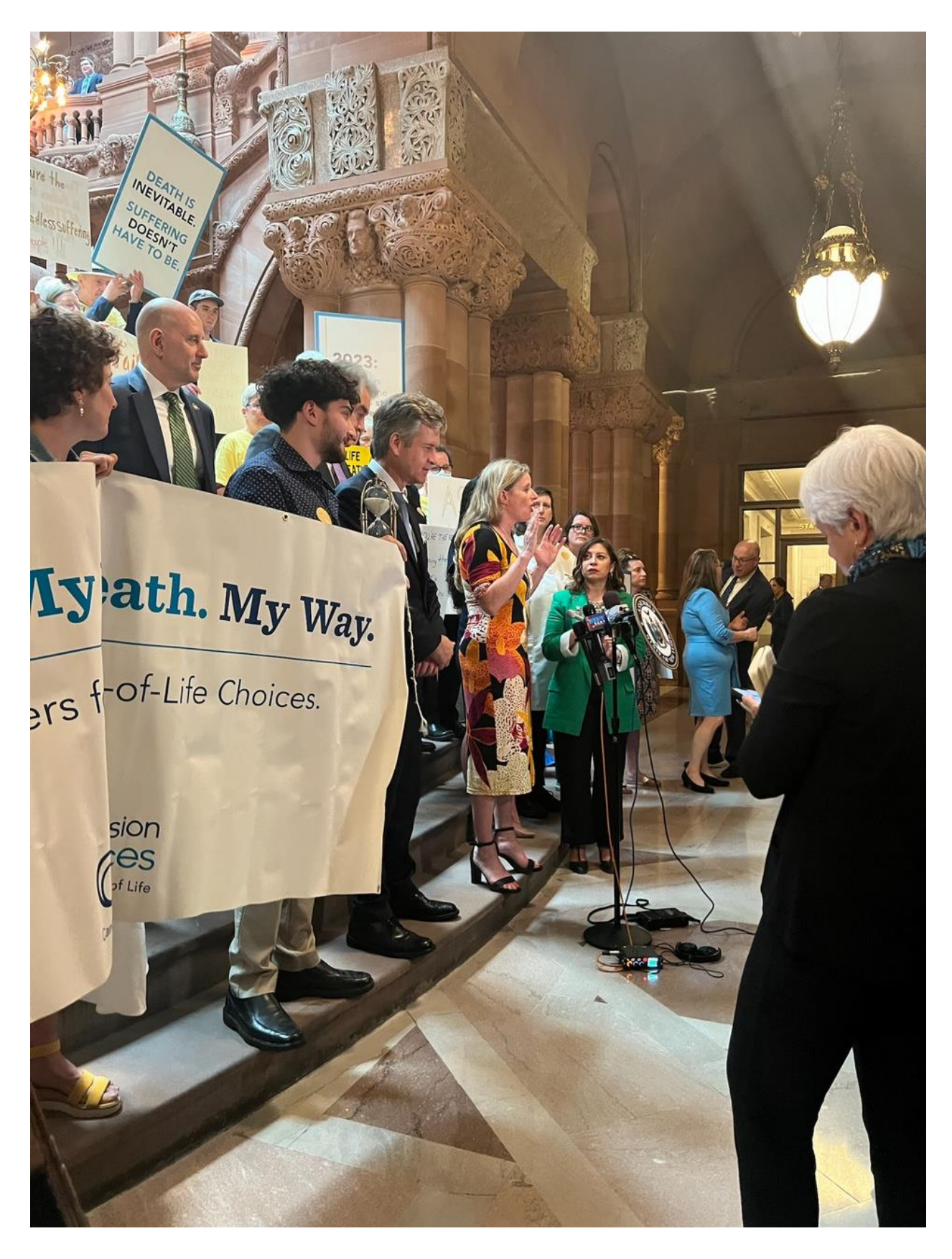
Medical Aid in Dying (A0995, Paulin)