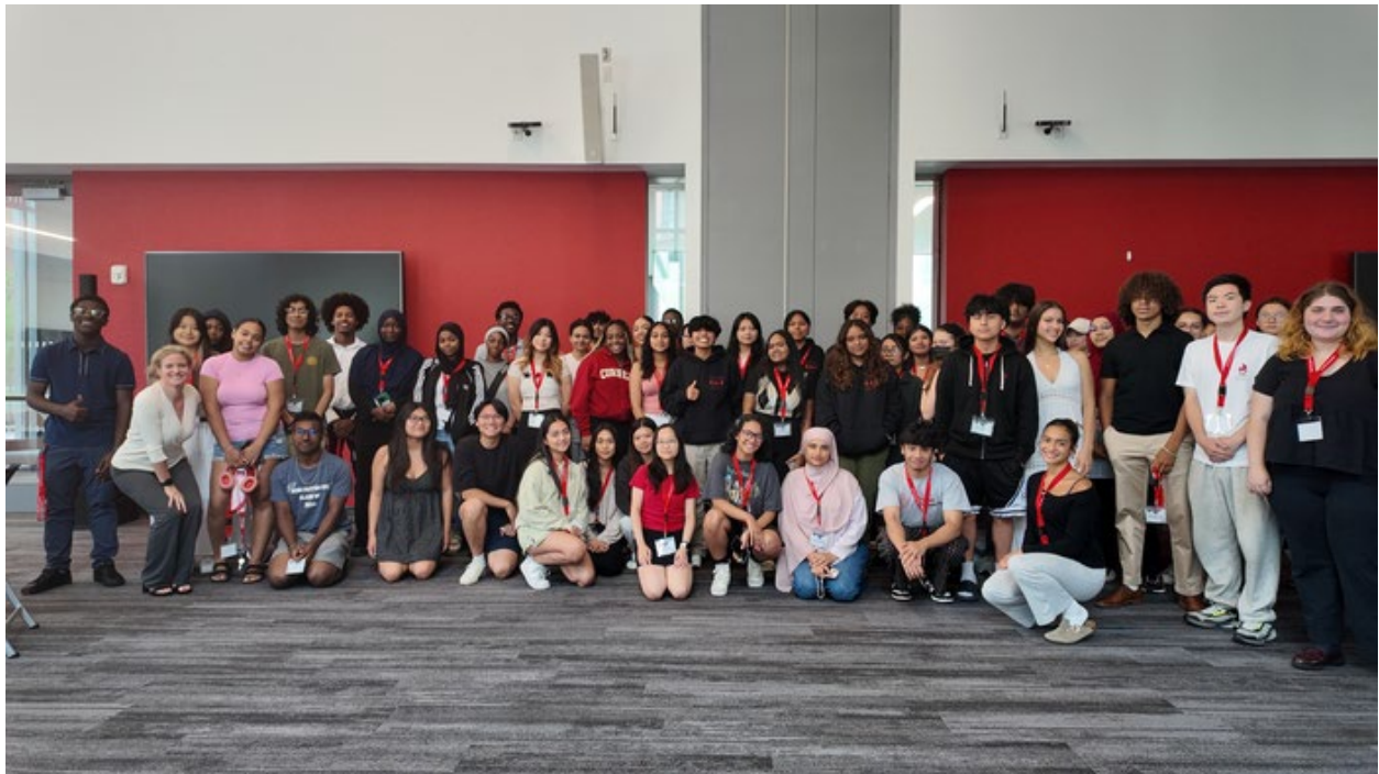
Cornell scholars celebrate the successful completion of a summer opportunity program before their first semester at college

adopted their rezoning, which allows for areas near the highway and town center to be more easily developed while preserving open space and residential properties further from the center. I look forward to having ongoing conversations with the community and supporting local businesses as they work to grow a vibrant walkable town center.