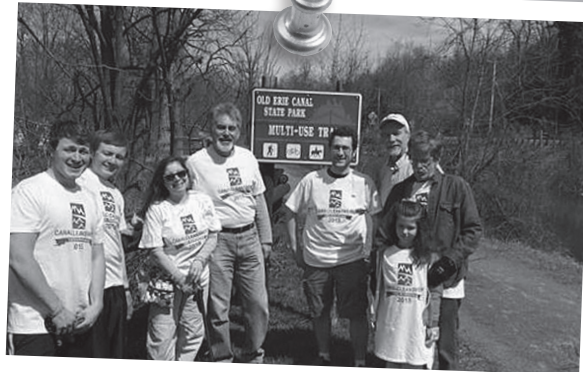
2015 Canal Clean Sweep