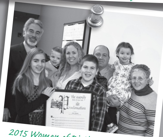
2015 Women of Distinction awards