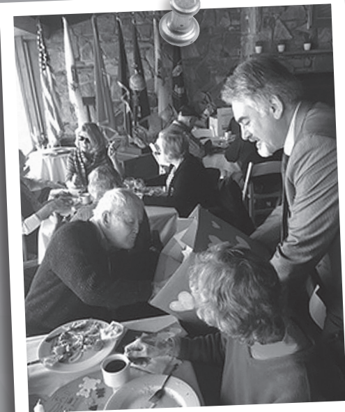
2015 Valentines for Vets program at Clear Path for Veterans