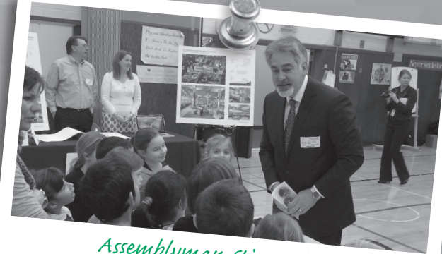
Assemblyman Stirpe visits Enders Road Elementary School