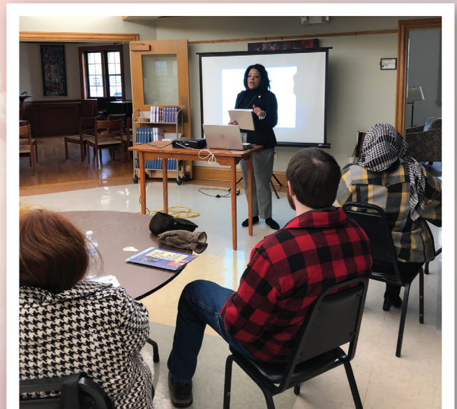
On Feb. 6, I attended a Public Utility Assistance Clinic hosted by Legal Services of Central New York, where I got the chance to speak to their staff attorneys during the work session.