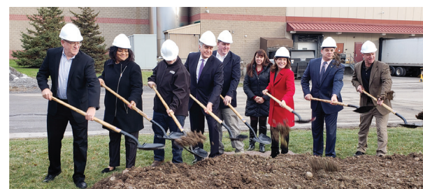
Lt. Gov. Kathy Hochul was on hand on Dec. 20 for the groundbreaking ceremony for the first phase of Byrne Dairy's Ultra Dairy plant expansion in the town of Dewitt. The initial phase includes a 42,000 square foot expansion that will allow the plant to increase its packaging capability as well as add additional processing capacity and storage space. It will also result in the creation of 30 new jobs and the retention of almost 200 jobs at the facility.

End of session update from Assemblymember Pamela J. Hunter