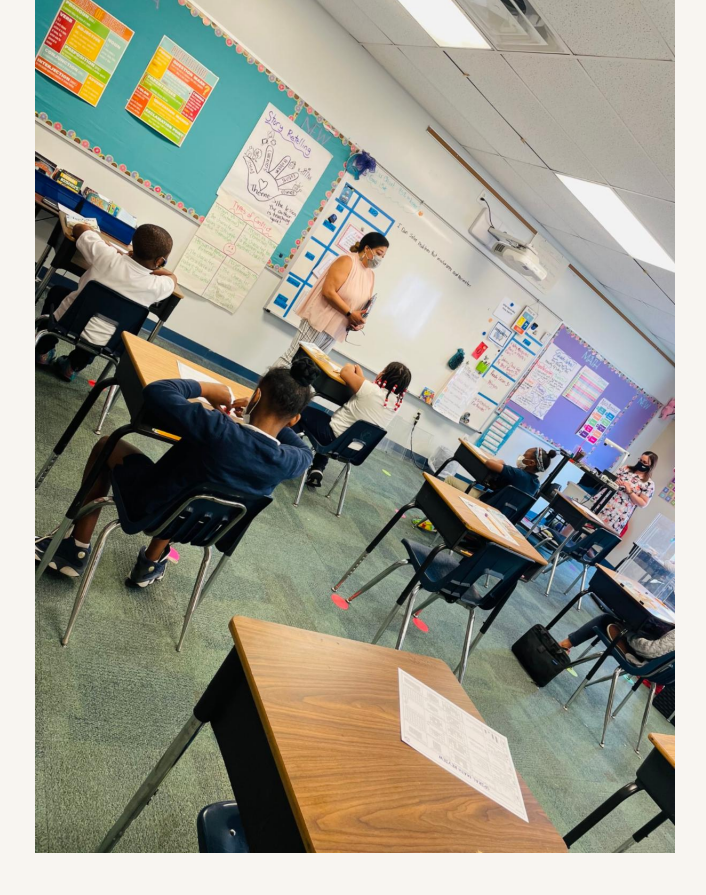
On May 17, I had the pleasure of touring Southside Academy Charter School and reading to a 4th grade class.