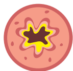
ASTHMATIC AIRWAY DURING ATTACK