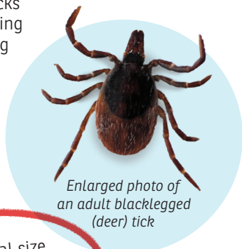
Enlarged photo of an adult blacklegged (deer) tick

Lyme disease is a bacterial infection that can produce skin, arthritic, neurological and even cardiac symptoms. You can become infected through the bite of a blacklegged tick (commonly known as a deer tick) that carries this bacteria. Not all blacklegged ticks are infected, but avoiding tick bites and removing a tick as soon as you find it can reduce the likelihood of contracting Lyme disease or any other disease the tick may be carrying.